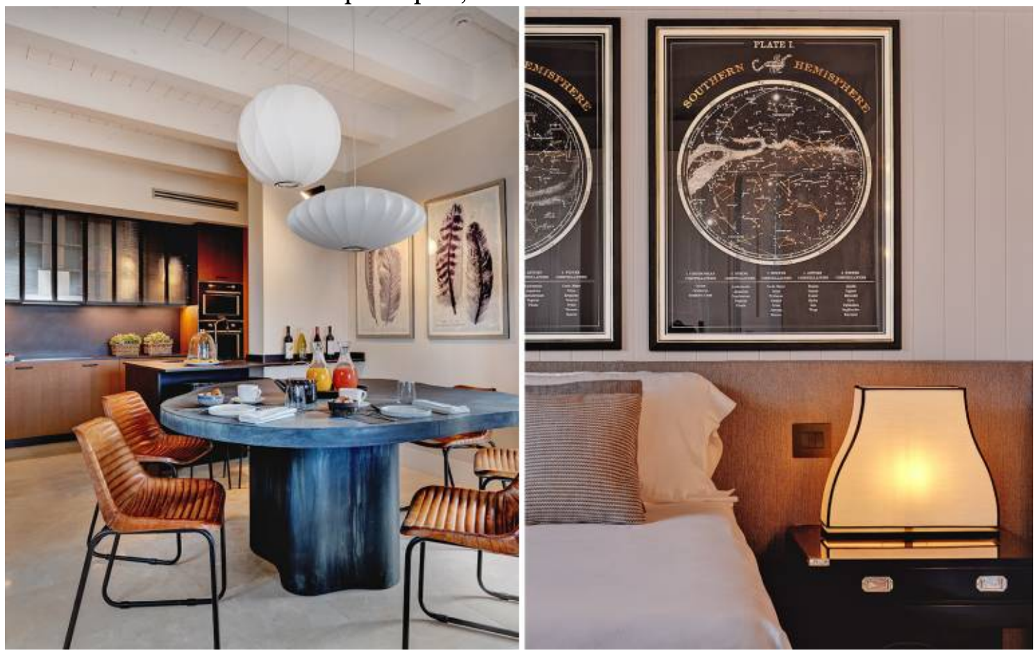
An elegant bedroom and smart living room in one of the villas

Although the championship course will test any golfer, it does not feel overmanicured, like many resort courses. Eco-friendliness rules, and the course is maintained according to sustainable environmental principles, with chemical fertilisers banned.