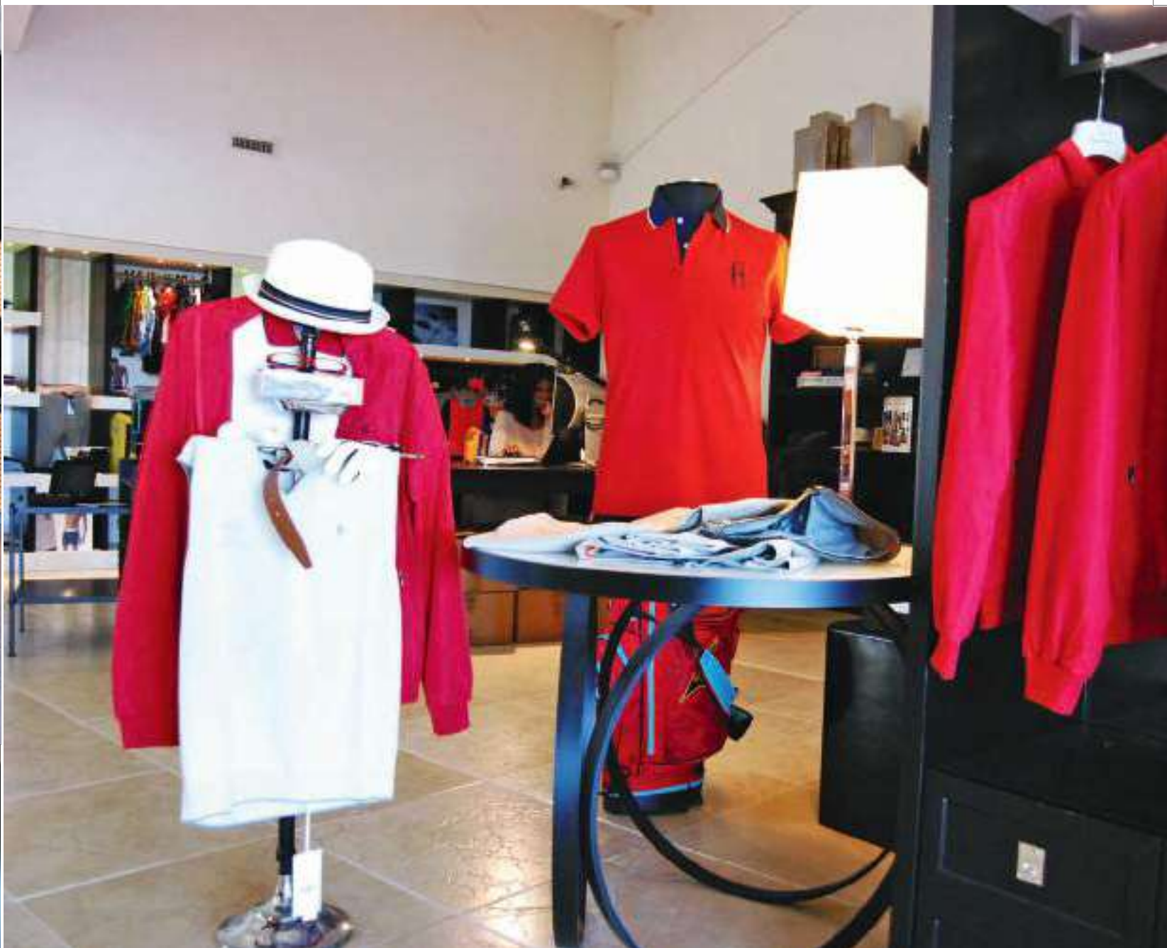
左页上图: 阿金塔里奥酒店大堂设计精巧的白色毛绒沙发; 左页左下图: 设计简约、现代的阿金塔里奥酒店客房; 左页右下图: 酒店客房的白色系空间设计令居住环境宽敞明亮; 右页上图: 阿倚金塔里奥酒店的商店中出售意大利和国际优质品牌的产品。

顶楼套房采用阁楼设计和珍贵的实木皮革装潢。家庭套房以浅色木料、复古家具和洁白的沙发为特色。折衷主义风格的主人套房建有连通式卫生间和带皮革裙边的浴缸, 融汇了西海岸风格和东方传统格调。豪华俱乐部套房由俱乐部楼层样式演化而来, 后者是酒店魅力精神的核心, 家具为暖调。商务套房采用当代风格, 暖色调风格结合深色木质家具和现代派照片装饰。水疗复式套房在设计时考虑到健身需求, 超大热水浴缸和土耳其浴室让人焕发活力。泰诺 KINESIS 健身设备和运动自行车让度假时光更加休闲。