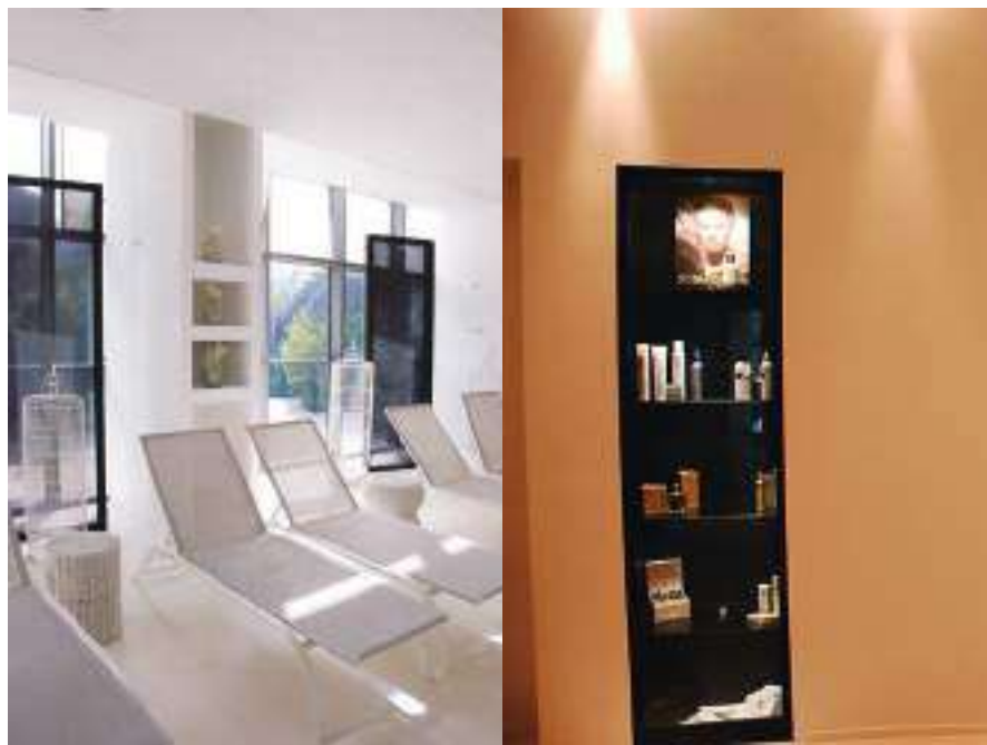
左页图: 在阿金塔里奥酒店 做一次 SPA, 彻底放松身 心; 右页图: 阿金塔里奥酒店的 水疗中心。

阿金塔里奥酒店的 Espace 健身中心提供贴心的健康管理, 满足所有宾客的需求和个性化要求。现代化的 Espace 健身中心采用白色风格装饰, 夹杂深浅不一的黑色和浅色木料, 创造出介于复古和现代之间的新风格。健身中心拥有新一代泰诺健健身设备, 可强健肌肉、完成有氧运动。专业私人教练保证提供高品质服务, 可实现训练方案的个性化。2700 平方米的水疗区包含配备泰诺健设备的健身中心、提供色光疗法的生物桑拿房、克奈圃环形区、室内暖水海水泳池、6 间按摩室、日光浴等各类服务。酒店在夏季开放露台上的两个游泳池, 宾客可以在托斯卡纳的阳光下放松身心。其中一个游泳池供儿童使用, 整个区域都环绕在绿色林木中。Espace